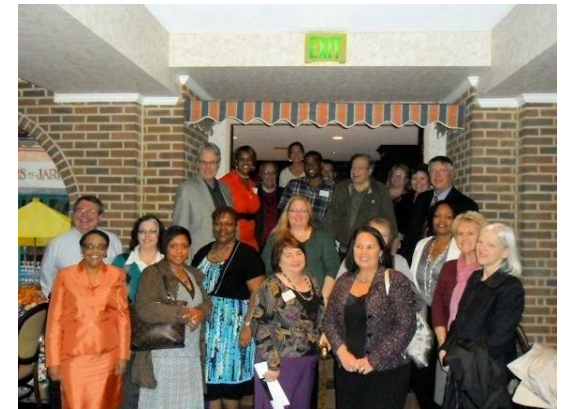
The Tidewater Chapter celebrates their 40th Anniversary

Want to Know More About the Tidewater Chapter of ARMA?